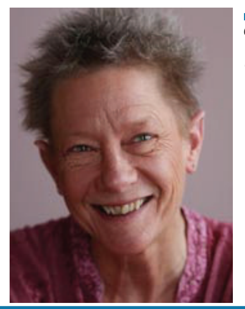
Onga's art displayed at the BASE office during the Art Crawl